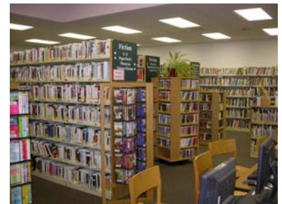
Library book stacks at capacity