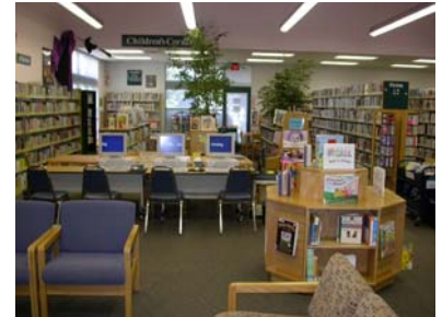
Limited seating and computers

Staff work areas are small and crowded. Book carts are staged along a narrow hallway, making passage difficult. Storage is at a premium; even the staff restroom is pressed into service as makeshift storage space.