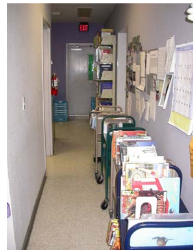
Crowded staff corridor