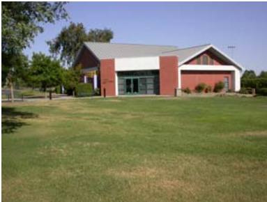
Galt Library and site