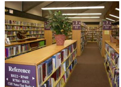
Crowded library stacks

Recent changes in materials handling, including moving check-in to the staff room, have greatly improved workflow at the circulation desk. However, this causes congestion at times in a workroom that already faces challenges of lack of space, ergonomics, and inefficient workflow.