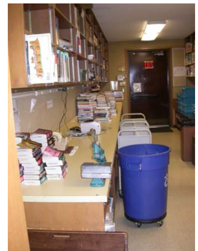
Inefficient layout of staff area