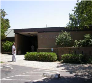
Rancho Cordova Library

The Rancho Cordova library is located on a busy thoroughfare on Folsom Boulevard at the stoplight at Paseo Rio Drive. The facility is located just outside of the city limits, but serves as the library for the City of Rancho Cordova as well as various communities in the unincorporated area. The existing library is fairly convenient to existing and older residential areas along the American River, east and north of Highway 50, and west towards Rosemont. It will be further from new residential growth to the east and south and will continue to be more undersized for the burgeoning population. Relatively few people access the library on foot or bicycle, because, to the east and west, both sides of Folsom Boulevard are unimproved with no sidewalk, and to the south, the library is separated from much of the community by Highway 50. There is a bus line that