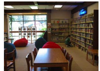
Teen area lacks separation from other areas