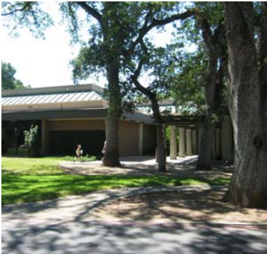
Sylvan Oaks Library in Citrus Heights