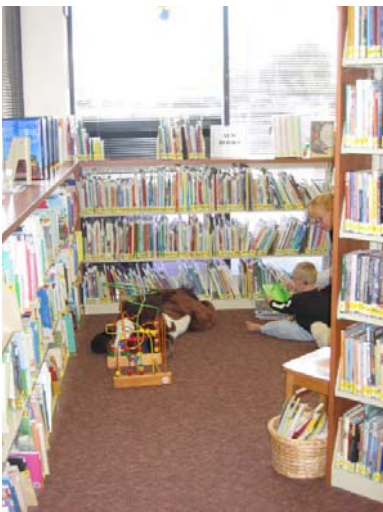
Crowded children's area