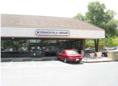
Orangevale Library in leased mall space

With a history of moving relatively frequently, the Orangevale Library is currently sequestered in a leased end unit in a small “strip” shopping center on Greenback Lane. Although Greenback is a busy thoroughfare, the library is not highly visible; only a small sign in the shopping center’s marquee announces the library’s presence. Parking is shared with other shops, and at almost all times spaces are hard to find.