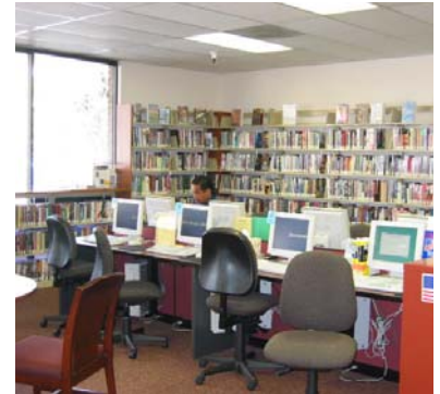
Limited computers and stacks at capacity

There is also no community room for programming. Storytimes and other children's programs are held in the only open area in the library, which is directly in front of the entrance, disrupting other library users during these times.