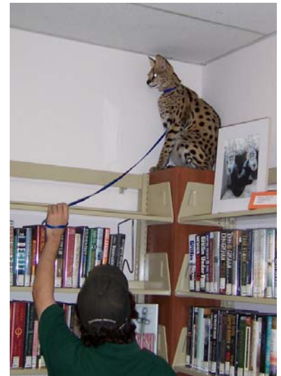
Program occurring in main library space